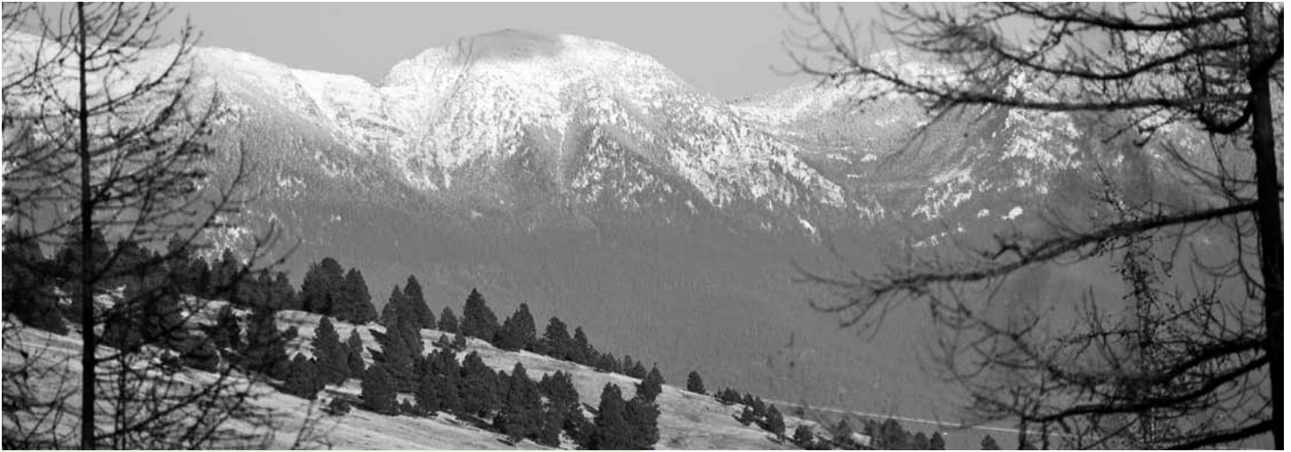
Spring View from the Overlook