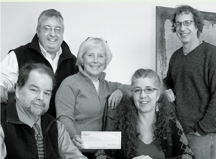
Official Closing on Phase 1, December 2010

* The actual amount awarded is contingent on finalization of the U.S. Congressional budget.