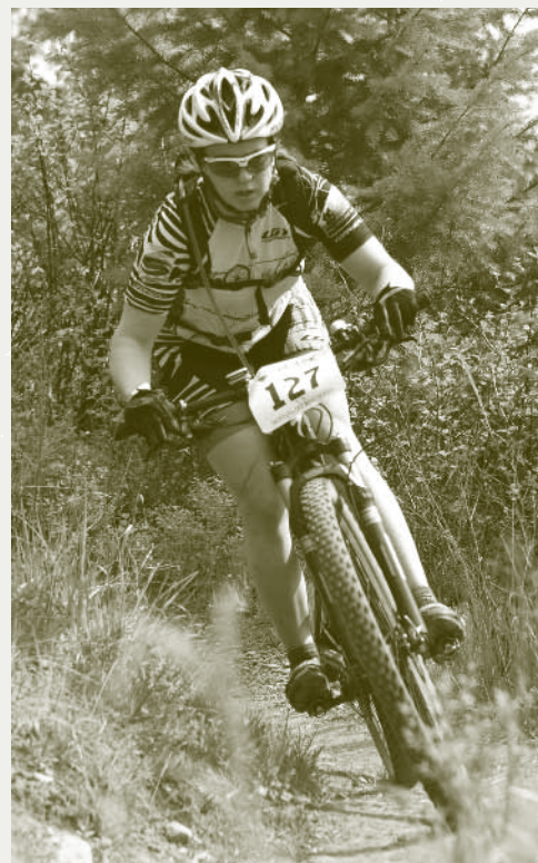
The annual Herron Hammer is May 17