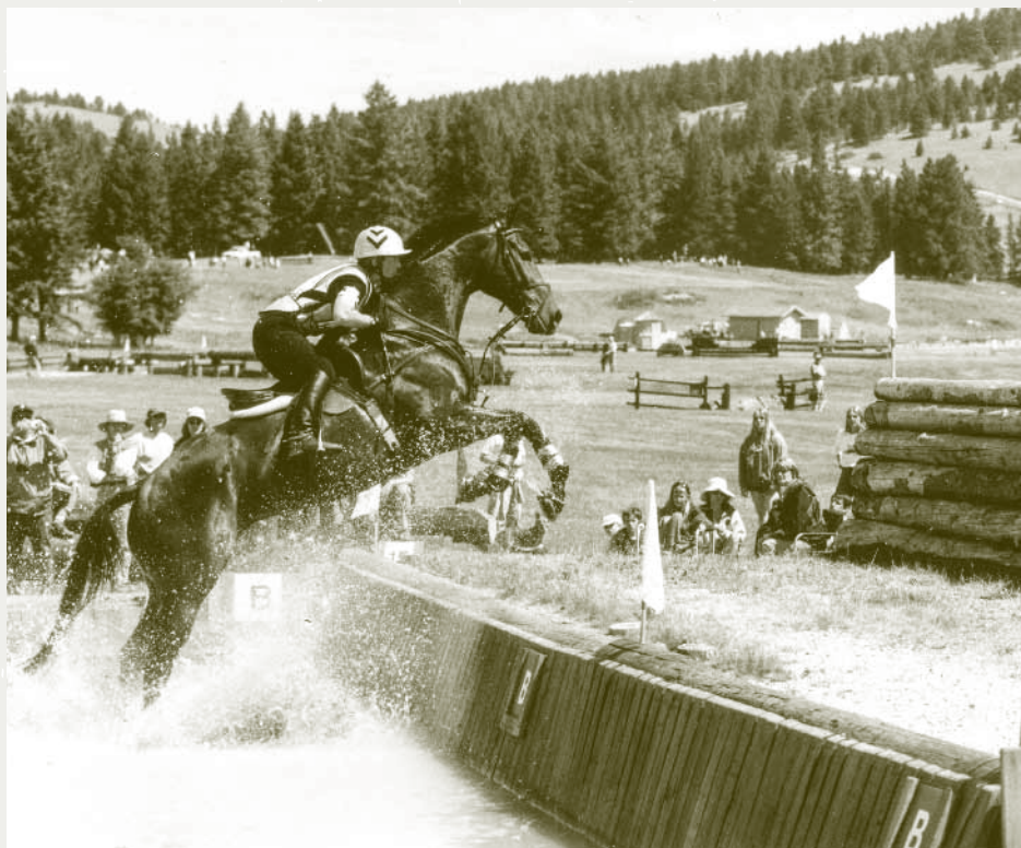
Come on out to Herron Park and see what the jumps in the meadows are all about. Cross-country horse jumping takes place May 30th, June 27th and August 29th in the afternoons. Mornings feature dressage and arena jumping. Everyone welcome and spectators are free.

September 5 & 6 (Sat & Sun): 24 Hours of Flathead bike race. Visit 24hrsofflathead.org for details and registration. Benefits D.R.E.A.M. adaptive recreation program.