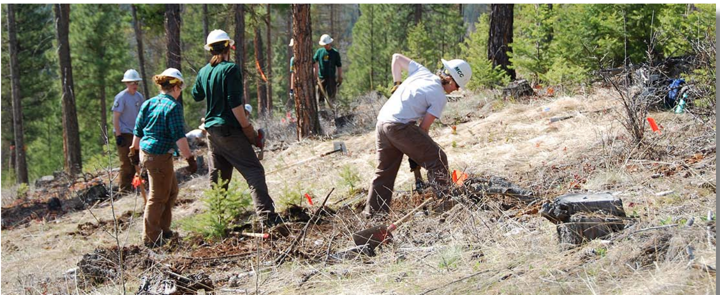
Montana Conservation Corps building the new Family Trail.