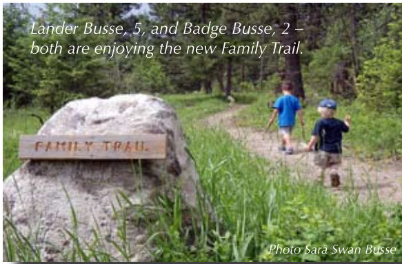
Lander Busse, 5, and Badge Busse, 2 – both are enjoying the new Family Trail.