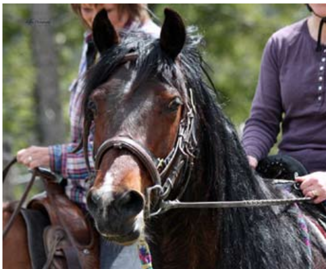
Cliff the Cob says "Follow me to Blacktail Mountain."

A total of 77 riders participated in this year's event, which included an 8-mile loop beginning and ending at Herron Park, followed by a barbecue and silent auction. Ellie Eberts of Elfen Photography took pictures of each horse and rider and is donating proceeds from photo sales to FTBT.