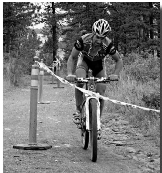
Participant in Herron Park XC Race.

Those of us at Flathead Cycling fully realize the importance of keeping and maintaining the trails we ride on above Herron Park. We are proud to help in the further expansion of lands above the park, so we all may continue the joy of riding on these precious trails!