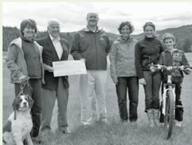
Valley Bank of Kalispell presented the final payment of their $20,000 pledge to FTBT in June 2012.

In the last three years we've secured permanent public access to 150 acres, adding them to Herron Park (the park was originally 120 acres). This puts our fundraising effort just under the half-way point; we still need to raise $1.1 million, so we can add another 170 acres. Imagine, 440 acres of permanently secure open space available for recreation and wildlife habitat, less than 10 minutes from downtown Kalispell!