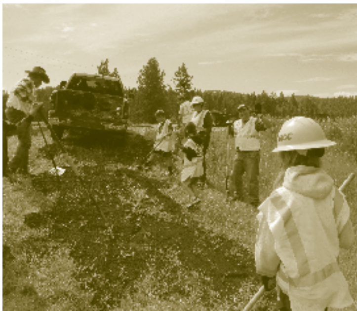
Kalispell Daybreak Rotarians and Montana Conservation Corps volunteers show off the newly seeded ditch