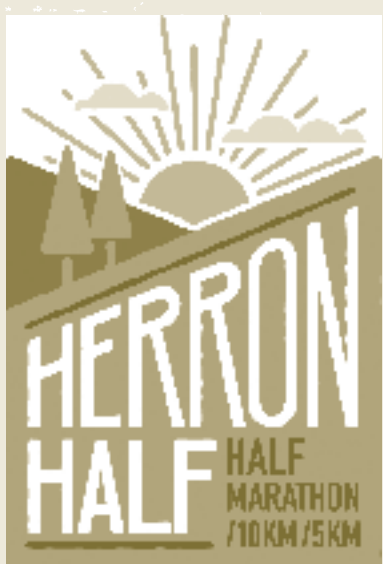
Herron Half, 10km and 5km