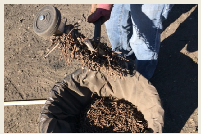
Hundreds of pounds of nails have been removed from Emmons' Saddle over the past three years.

FTBT aspires to provide a safe and fun working environment and, of course, will provide food at every volunteer day. It's a great way to give back and connect with your community and your land.