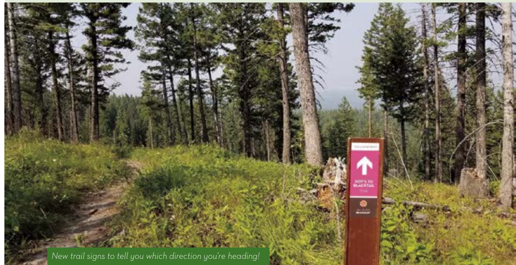
New trail signs to tell you which direction you're heading!