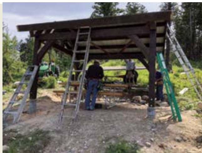
The hiker's shelter was built in just one day!