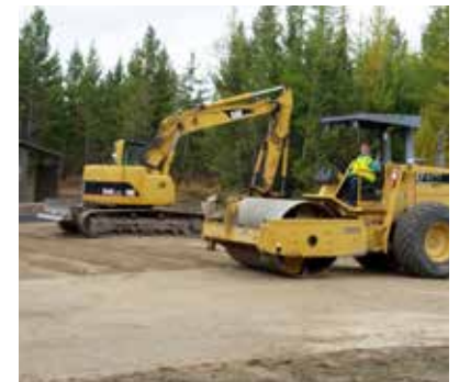
Several students from FVCC got real world experience building the new trailhead at Emmons Saddle as part of the Heavy Machinery certification program.

We had the help of Flathead Valley Community College Heavy Equipment Operator students to put the finishing touches on the Emmons Saddle trailhead this summer. This FVCC program gives students hands-on experience using various heavy equipment and it was a win-win combo to have their help "rolling out" the parking lot. FTBT offers a dump truck full of gratitude for your help!