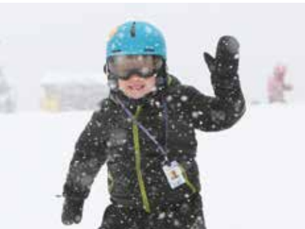
Adventuring is a family affair in Montana!